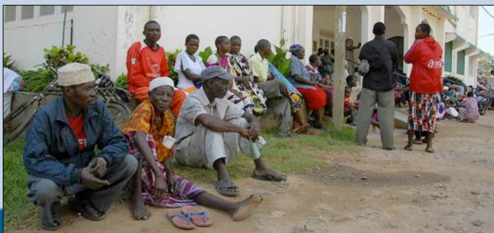
Crowds waiting at Tawfiq Hospital, the Islamic community hospital.

Most of all, the team is so thankful to have been able to utilize their talents to provide surgical services, in the name of Jesus, to those who are so needful. Being able to do this in both a government and Islamic hospital in Kenya was a very special blessing.