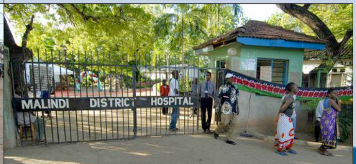
The front gate at the government hospital, Malindi District.