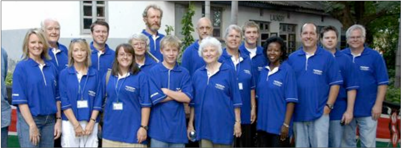
Team members at the Prime Minister's visit at Malindi District Hospital.

Below: Images from the banquet for the Prime Minister at Eden Roc Hotel.